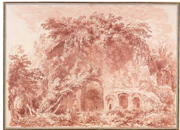
Jean-Honoré Fragonard, (1732–1806), View of the Serapeum at Hadrian’s Villa , c. 1760, red chalk, over black chalk underdrawing, 35.1 x 48.3 cm, Fondation Custodia, Paris

Boucher’s greatest student was Jean-Honoré Fragonard, who is represented by four works in the exhibition, all acquired by Lugt himself. Ironically, the greatest drawing in this group, View of the Serapeum at Hadrian’s Villa , entered the collection in 1922 as a work by Hubert Robert. This magisterial, red-chalk landscape is one of a group that Fragonard made in Tivoli and its environs during the summer of 1760. As a protégé of the abbé de Saint-Non, who had rented the Villa d’Este for three months, Fragonard was invited to spend six weeks sketching in the Roman campagna. Although most of his drawings were made on the Este property, a small number—this sheet included—took as their subject views of the grounds of Hadrian’s Villa, four miles to the southwest of Tivoli. In the Lugt drawing, Fragonard shows the ruins of a complex of buildings, which, during the eighteenth century, were thought to be Hadrian’s re-creation of the Egyptian town and canal dedicated to the god Serapis. Modern scholarship has identified the site as the villa’s dining area, or serapeum . It has been well said that, for all his remarkable fidelity, Fragonard