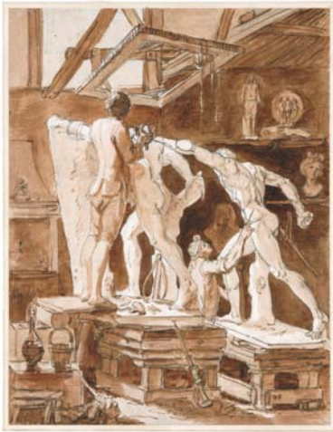
Esprit-Antoine Gibelin, (1739–1813), Interior of a Sculptor's Atelier with the Borghese Gladiator , c. 1770, pen and brown ink, brown wash over black chalk, on two pieces of paper, joined horizontally, 23.7 x 18.3 cm, Fondation Custodia, Paris

approached his Roman views more as a poet than as a surveyor: for all the accuracy of his depiction, he communicates his pleasure in the luxuriance of the foliage, the burning heat of the noon day sun, and, above all, the immensity of the ruins that dwarf the three boys shown seated in the foreground.