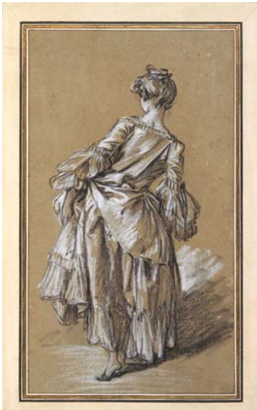
François Boucher, (1703–1770), Standing Woman Seen from Behind , c. 1742, black, red, and white chalk, with stumping, on gray-brown paper, 35.3 x 19.9 cm, Fondation Custodia, Paris

Watteau was Lugt’s favorite French artist, and six works by him form the largest group in the exhibition. The most intimate, Woman Reclining on a Chaise Longue (front page), is one of a series of studies made around 1718 from a model hired to pose in rented rooms for the artist and a select number of his art-loving friends. Only after we realize that this day-dreaming young woman is shown with her nipples exposed are we aware of the eroticism of this sheet. Although he pursued a successful career as a history painter in the Royal Academy, François Boucher was, in many ways, Watteau’s most gifted successor. In his twenties Boucher copied many of Watteau’s drawings for an engraved compendium, and the motif of an elegant woman, seen from behind, is a figural type that originated in Watteau’s mature oeuvre. Standing Woman Seen from Behind is one of Boucher’s most vigorous and accomplished studies and relates to the figure who attends her seated mistress in the genre painting Lady Fastening Her Garter (“ La Toilette ”), signed and dated 1742, and today in the Museo Thyssen-Bornemisza, Madrid.