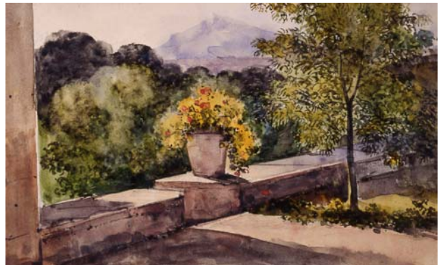
François Marius Granet, (1775–1849), View of Mont Sainte-Victoire from the Terrace of Malvalat , 1844?, watercolor partially heightened with gum arabic, graphite underdrawing 10.5 x 16.9 cm, Fondation Custodia, Paris

View of Mont Sainte-Victoire from the Terrace of Malvalat is one of the most accomplished watercolors of François-Marius Granet. The artist spent more than twenty years in Rome and established a thriving practice as a painter of cloisters and monasteries, which were exhibited to acclaim in Paris in the Salons of the Restoration and July Monarchy. His fluent and luminous watercolors, for which he is much admired today, were done as a form of relaxation and were never shown in public during his lifetime. The sun-filled sheet in the Lugt collection, acquired in 1995, was probably made around 1844 and depicts the view from Granet's country house outside Aix-en-Provence. In this carefully structured composition, the terracotta pot with its cascading orange and yellow flowers serves as the focal point, anchoring the diagonal stone ledge that overlooks the grounds below. The bands of strong sunlight and deep shadow add to the rigor and sense of construction that are everywhere apparent in this seemingly informal view.