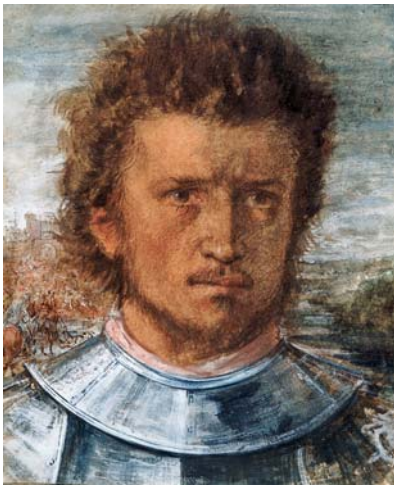
Edgar Degas, (1834–1917), Head of a Soldier , c. 1859, watercolor, gouache, and red chalk wash over graphite, 25.6 x 21.0 cm. Fondation Custodia, Paris