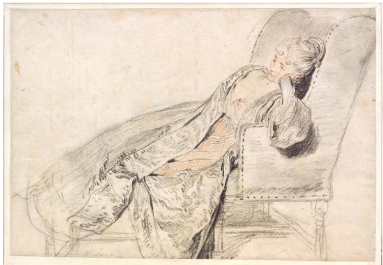
Antoine Watteau, (1684–1721), Woman Reclining on a Chaise Longue , c. 1718, red and black chalk with stumping, 21.7 x 31.1 cm, Fondation Custodia, Paris

As its major fall exhibition, the Frick is pleased to present Watteau to Degas: French Drawings from the Frits Lugt Collection , featuring more than sixty works on paper from the holdings of the Fondation Custodia, Paris. On view until January 10, 2010, it includes drawings and watercolors by well-known masters of the French School, including Antoine Watteau, François Boucher, Jean-Honoré Fragonard, Jacques-Louis David, Eugène Delacroix, Jean-Auguste-Dominique Ingres, and Edgar Degas, as well as by important figures who may be