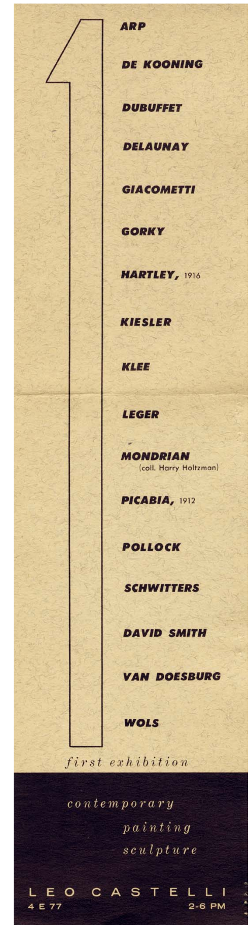
First Exhibition. Leo Castelli. February - March 2, 1957.