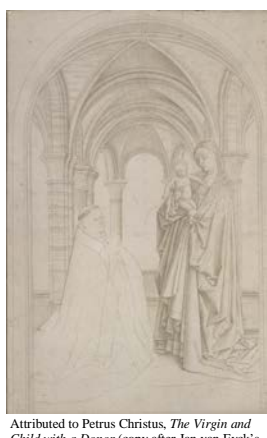
Attributed to Petrus Christus, The Virgin and Child with a Donor (copy after Jan van Eyck's Maelbeke Virgin), silverpoint on prepared paper, The Albertina Museum, Vienna

donor being introduced by saints to holy figures—in most cases the Virgin and Child—whose intercession they sought. Generally, memorials would be placed above the tomb of the deceased, thus functioning as grave markers. Their frames usually bore an inscription that identified the deceased and petitioned passers-by to pray for the repose of the deceased's soul. Indeed, during the fifteenth century, prayers from the living were believed to hasten the release of the deceased's soul from purgatory into heaven, and memorials were created specifically in order to secure suffrages for the dead.