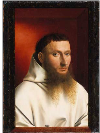
Petrus Christus, Portrait of a Carthusian Lay Brother, 1446, oil on

illustrated manuscripts from the charterhouse, its decoration is worn from generations of monks touching and kissing the holy figures depicted within it. Another outstanding work in the exhibition is associated with Genadedal: Petrus Christus's Portrait of a Carthusian Lay Brother . Painted in 1446, it probably depicts one of the charterhouse's members and is thought to be the earliest surviving portrait of a cleric not depicted in the act of praying.