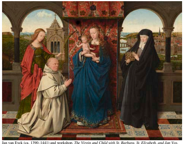
ca. 1441–43, oil on masonite, transferred from panel, The Frick Collection

September 18, 2018, through January 13, 2019