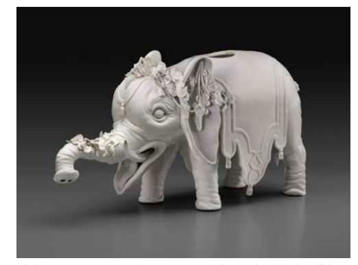
Elephant Wine Dispenser, ca. 1740, hard-paste porcelain, The Frick Collection, gift from the Melinda and Paul Sullivan Collection, 2016

second manufactory in Europe to produce true porcelain, after the Royal Meissen Manufactory, outside Dresden. Although in operation for only twenty-five years, Du Paquier left an impressive body of inventive and often whimsical work, forging a distinct identity in the history of European porcelain production.