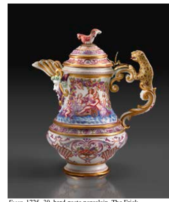
Ewer, 1725–30, hard-paste porcelain, The Frick Collection, gift from the Melinda and Paul Sullivan Collection, 2016

While the Du Paquier manufactory often took inspiration from Meissen and Asian porcelain, it also developed its own innovative decorative styles, forms, and techniques. A hallmark of the manufactory is its playful handles, knobs, and finials in the shape of animals or figurines. An exuberant ewer in the exhibition (right) features a handle in the shape of a panther (generally associated with Bacchus, the Roman god of wine) and an elaborately painted scene featuring the sea goddess Amphitrite, suggesting that the vessel was meant to serve both wine and water. This piece also illustrates perhaps the most characteristic feature of Du Paquier porcelain, its vivid painted decoration, in a palette dominated by rich purple and pink, iron-red, violet, blue, yellow, and several shades of green.