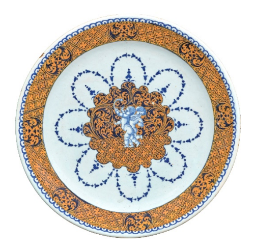
Plate, Rouen, ca. 1725, Faience (tin-glazed earthenware), D. 9 5/6 inches, Sidney R. Knafel Collection

October 10, 2018, through September 22, 2019