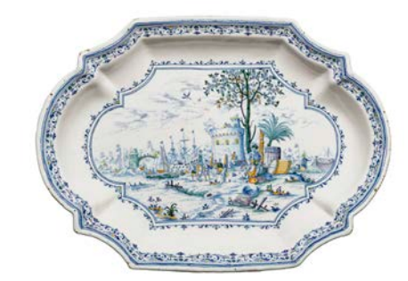
Clérissy manufactory, Platter , Moustiers, ca. 1730–40, Faience (tin-glazed earthenware), H: 12 1/4 inches W. 16 7/8 inches, Sidney R. Knafel Collection.

King sent his private collection of silver furniture to the royal mint to be melted down, an example reluctantly followed by the aristocracy, who were pressured to relinquish their own precious metal objects—mostly silver table services—for the benefit of the state. As described about 1715 by the celebrated French memoirist Saint-Simon, this resulted in a sudden craze among French aristocrats for domestic faience: "In eight days, all who were of grand or considerable standing used only faience services. They emptied the shops selling it, and ignited a heated frenzy for this merchandise."