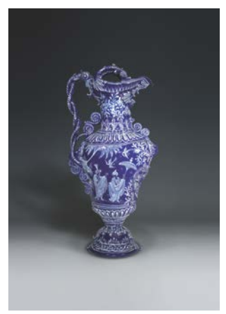
Ewer, Nevers, ca. 1680, Faience (tin-glazed earthenware), H. 27 1/2 inches, W. 13 inches, Sidney R. Knafel Collection

grotesques is largely inspired by Italian models. Its monochrome blue decoration, however, was produced mainly in Nevers but never in Italy.