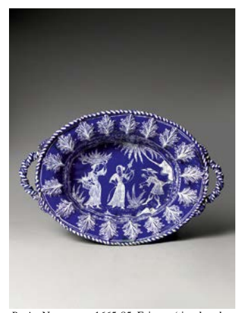
Basin, Nevers, ca. 1665-85, Faience (tin-glazed earthenware), H. 19 1/2 inches, L. 22 3/4 inches, Sidney R. Knafel Collection, Photo: ⊚Camille Leprince

peddlers—is inspired by early seventeenth-century French literature, including the popular novel L'Astrée , by Honoré d'Urfé (published 1607–27). These two exceptional pieces were originally intended for display during a banquet, set out on a credenza to impress guests, either inside a princely residence or outdoors, in a lavish jardin à la française (French garden).