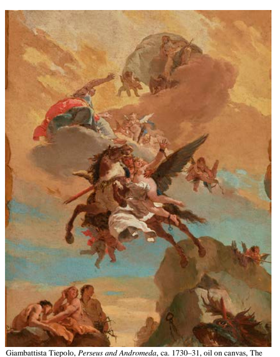
Frick Collection, New York; photo Michael Bodycomb

Next spring, The Frick Collection will reunite a series of preparatory paintings and drawings related to Giambattista Tiepolo's (1696–1770) first significant project outside of Venice, a series of ceiling frescoes for Palazzo Archinto in Milan, executed between 1730 and 1731. The paintings were commissioned by Count Carlo Archinto (1670–1732), whose family distinguished itself in the seventeenth and eighteenth centuries under both the Spanish and imperial rulers of Milan. Tragically, the Palazzo was bombed during World War II, and its interior was completely destroyed. The only record of the finished frescoes in situ is a series of black and white photographs taken between 1897 and the late 1930s. Tiepolo in Milan: The Lost Frescoes of Palazzo Archinto will present approximately fifty objects from collections in the United States and Europe to tell the story of this important commission. It will feature five surviving preparatory paintings and drawings by the artist, among them the Frick's oil