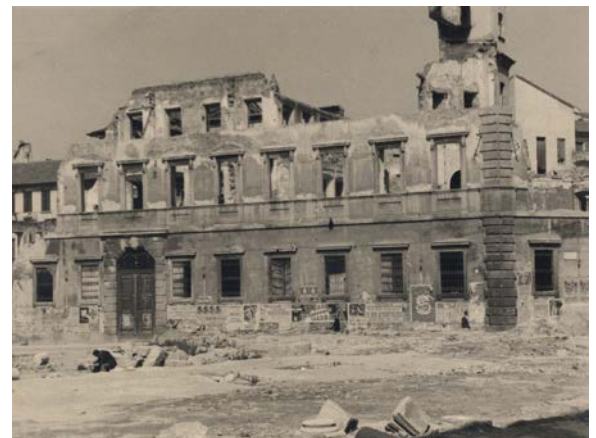
Unknown photographer, Palazzo Archinto after bombing in August 1943 , 1948, photograph, Azienda di Servizi alla Persona Golgi-Redaelli, Milan; photo: Su autorizzazione dell’Azienda di Servizi alla Persona Golgi-Redaelli di Milano

The palazzo belonged to the Archinto family for more than a century, until 1825, when the family sold it. In 1853, it was purchased by the current owner, Luoghi Pii Elemosinieri, a charitable institution (now called the Azienda di Servizi alla Persona Golgi-Redaelli). On the night of August 13, 1943, Allied bombs hit Palazzo Archinto, destroying its interior, including Tiepolo’s frescoes. (The interior was rebuilt between 1955 and 1967, following the general structure of its previous architectural form.) During World War II, sixty-five percent of Milan’s historic monuments were damaged or destroyed. Tiepolo’s frescoes at Palazzo Archinto were among the most tragic losses.