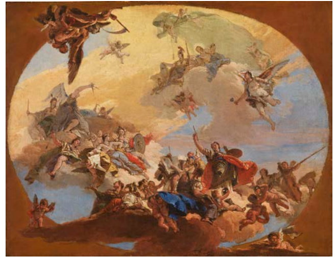
Giambattista Tiepolo, Triumph of the Arts and Sciences , ca. 1730–31, oil on canvas, Museu Nacional de Arte Antiga, Lisbon

The largest and most elaborate fresco at Palazzo Archinto was the Triumph of the Arts and Sciences , which decorated one of the main rooms on the palace's principal floor, or piano nobile . In it, Tiepolo depicted a resplendent sky with an assembly of allegorical figures, including Architecture, Painting, Sculpture, Music, and Mathematics, under the aegis of Apollo and Minerva. The ceiling's decoration surely related to Carlo's intellectual pursuits and to his library. When Tiepolo created the sketch ( modello ) for the ceiling, the fictive architectural scheme ( quadratura ) that was to frame the fresco had not yet be finalized; he therefore depicted his figures hovering in a cloudy sky, surrounded only by an area of brown ocher. In preparation for his fresco cycles, Tiepolo executed numerous drawings. Two surviving drawings related to Triumph of the Arts and Sciences are included in the exhibition, together with the related Lisbon modello and black-and-white photographs of the finished fresco in situ.