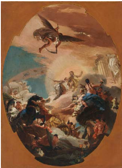
Giambattista Tiepolo, Apollo and Phaëton , ca. 1730–31, oil on canvas, Los Angeles County Museum of Art; Gift of The Ahmanson Foundation