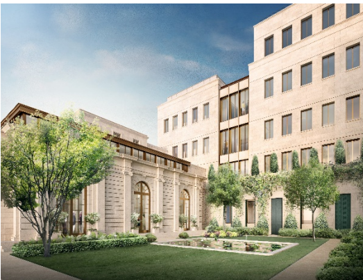
The Frick Collection from 70th Street; courtesy of Selldorf Architects