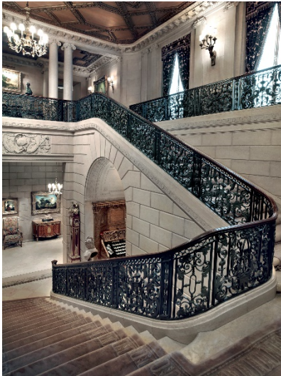
The Frick Collection's grand staircase, pre-renovation