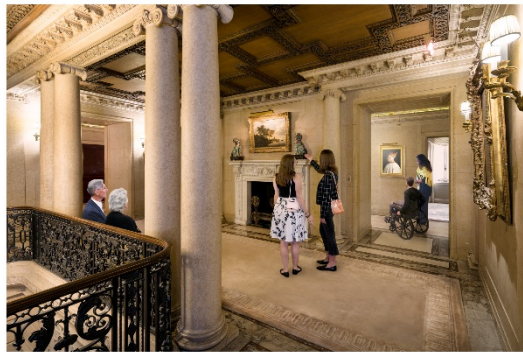
The second-floor landing, which leads to a series of new galleries for the display of small-scale objects from the permanent collection; courtesy of Selldorf Architects