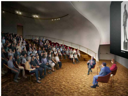
The auditorium; courtesy of Selldorf Architects