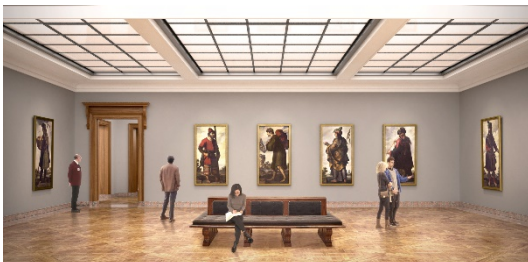
Special Exhibition Gallery; courtesy of Selldorf Architects