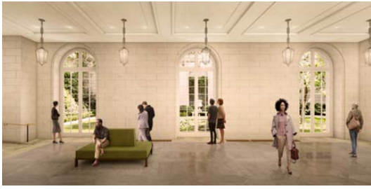
The Reception Hall overlooking the 70th Street Garden; courtesy of Selldorf Architects