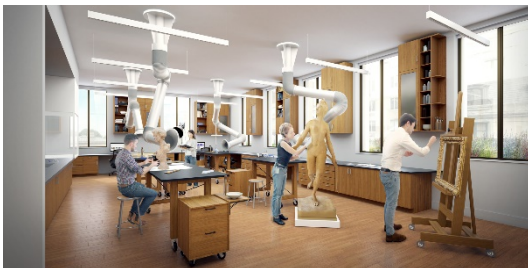
The museum's new objects conservation studio; courtesy of Selldorf Architects