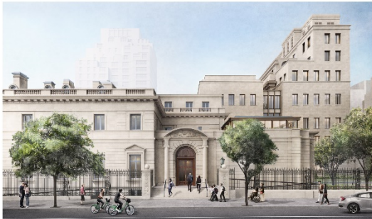
The Frick Collection from 70th Street; courtesy of Selldorf Architects