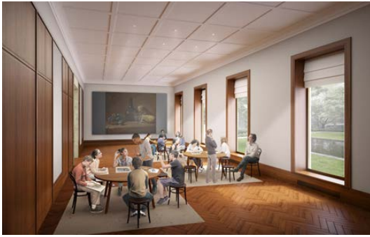
The newly created Education Room; courtesy of Selldorf Architects