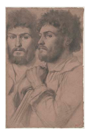
Edgar Degas (1834–1917), Two Portrait Studies of a Man, c. 1856–57, graphite with stumping and white chalk on paper, © Sterling and Francine Clark Art Institute, Williamstown, Massachusetts; Photo credit: Michael Agee

One of the earliest works in the exhibition is a sheet made by Edgar Degas while still a student of the École des Beaux-Arts. Since the founding of the Academy in the seventeenth century, generations of students followed a prescribed curriculum in order to acquire the shared language and subjects of classical representation. While the Academy's prestige waned in the later nineteenth century, its methods still formed the educational foundation of many of the most progressive artists. Here, Degas depicts the half-length figure of a model in profile and full face, each exhibiting a different expression. The clenched hand emerging from the sleeve of the figure in profile positioned in the center of the sheet ingeniously serves both views of the man. This beautiful study sheet attests to Degas's early mastery of composition and the methods of classical draftsmanship, as seen in the subtle range of light and dark and polished finish that rivals Ingres. From such virtuoso exercises sprang Degas's later audacious