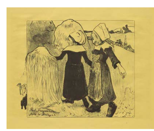
Paul Gauguin (1848–1903), Joys of Brittany, from the Volpini Suite, 1889, zincograph on paper

In Paul Gauguin's Joys of Brittany , the scene shifts from urban modernity to rural utopia. Here Gauguin extends his bold, simplified manner of drawing to the technique of zincography. Although a novice printmaker, Gauguin chose to work on a grained zinc plate in crayon and tusche wash applied with a brush, a challenging method that afforded him a subtle range of tonal and textural effects. In this sheet, one of eleven zincographs printed on striking canary yellow paper, Breton girls in clogs and traditional headdresses perform a country dance. The work forms part of the so-called Volpini Suite , named for the proprietor of the Café des Arts, where Gauguin and his friends staged a show in direct opposition to the officially sanctioned