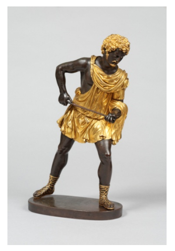
Pier Jacopo Alari Bonacolsi, called Antico (c. 1455–1528), Meleager, probably by 1496, bronze with gilding and silvering, 12 1/8 inches, Victoria and Albert Museum, London, Purchased from the Horn and Buyan bequests with the assistance of a contribution from The Art Fund

To Antico and his patrons, ancient sculpture represented the model of artistic perfection. Antico's older contemporary, the painter Andrea Mantegna, set the example at the Gonzaga courts. In the Lives of the Artists of 1550, Giorgio Vasari wrote of Mantegna, "Andrea always believed that good classical statues were more perfect and possessed more beautiful parts than those that are shown by nature." Because ancient marble sculptures known to the Renaissance were often fragmentary relics, imaginative reconstruction was required before their beauty might outshine nature's own. Mantegna brought an entire classical world to life in his encyclopedic paintings. As a sculptor, Antico concentrated on reconstructing individual classical works, both in fact and in his own art. During the 1490s (and probably earlier), Antico spent time in Rome working as a restorer of ancient marbles. He recorded this activity by inscribing the monumental statues of the Horse Tamers on the