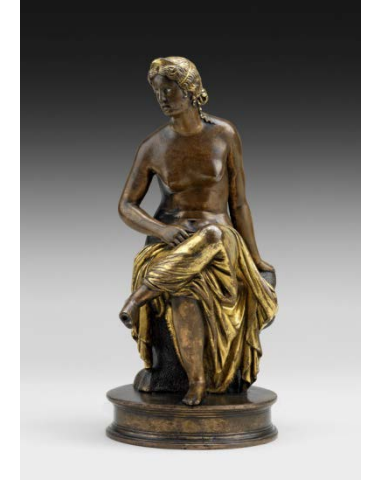
Pier Jacopo Alari Bonacolsi, called Antico (c. 1455–1528), Seated Nymph , c.1503–1511, bronze with gilding and silvering, 7 5/8 inches, Private

three. Comparison of Antico's two Seated Nymphs reveals some of the small, but significant, differences that can exist between bronzes that derive from the same wax model. The hair of one is pulled into a knot above her brow (above), and each curl is gracefully articulated. The other (at right) wears a plain diadem. She is simpler overall and was probably less highly worked in the wax casting model than her more elaborate counterpart. Such differences may also reflect the fact that Antico often entrusted other masters to cast his bronzes. Although Antico's replicative casting technique might have generated a lucrative income, he apparently did not undertake the serial production of his works. His obligations as a court sculptor, which included consulting on the purchase of antiquities and