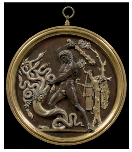
Pier Jacopo Alari Bonacolsi, called Antico (c. 1455–1528), Hercules and the Lernaean Hydra, c. 1496, bronze with gilding, 12 7/8 inches, Museo Nazionale del Bargello, Florence

Belvedere—they vigorously acquired small-scale antiquities, among them as cameos, engraved gems, and bronze statuettes. Antico's first patron, Gianfrancesco Gonzaga di Ròdigo, was a renowned collector of Roman coins. His death inventory of 1496 records an astonishing group of 2,095 in gold, silver, and bronze. Ancient coins inspired the Renaissance art form of the portrait medal, and of all fifteenth-century examples, Antico's most resemble Roman coins in format and symbolic language. His medal of Gianfrancesco (previous page) is exactly the same size as an imperial sestertius, and he shows the lord draped like an emperor. On the reverse, the gods Mars and Minerva flank a personification of Fortune, and all three stand on a flat platform, called an exergue , which is typically found on Roman coins. Yet other elements, like Gianfrancesco's hairstyle, are contemporary, and the figures on the reverse are larger and more voluptuously rendered than their classical prototypes. Antico's command of numismatic conventions endows the medal with ancient authenticity, convincingly transformed into a modern idiom. By including his signature (ANTI) beneath the exergue , Antico provokes the comparison between past and