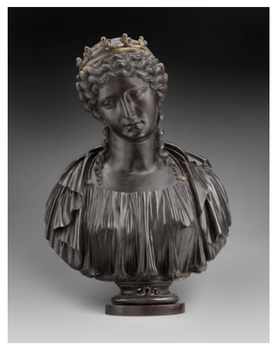
Pier Jacopo Alari Bonacolsi, called Antico (c. 1455–1528), Cleopatra, c. 1525, bronze with traces of gilding, 25 3/8 inches, Museum of Fine Arts, Boston, William Francis Warden Fund

Antico's last Gonzaga patron, Isabella d'Este, Marchioness of Mantua, was the greatest female collector of the Renaissance. She indulged her admitted "insatiable appetite for antiquities" for more than thirty years and developed a famed collection that was identified with her taste, sophistication, and character as a ruler. Antico and Isabella formed a close, enduring relationship. Although she tended to manage every detail of a commission, often to artists' dismay, in 1503 she entrusted Antico to choose the subject of a female statuette intended for the cornice over the doorway of the room where she displayed her greatest works. This statuette was most likely the Seated Nymph . Presiding over a gathering of figurative works, the delicately pensive Nymph invited the elevated state of contemplation that is inspired by beauty. For the life-size bust of Cleopatra , at left, Antico imagined a resplendent queen whose outward beauty reflects her