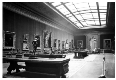
The West Gallery of The Frick Collection, 1935.

Gainsborough, Goya, El Greco, Holbein, Houdon, Ingres, Rembrandt, Renoir, Turner, Vermeer, Whistler, and others, as well as related special exhibitions, education programs, and concerts. Anniversary celebrations in 2010 have included a summertime display of archival architectural drawings, lectures and other education programs, anniversary-themed member events, and the debut of a new orientation film.