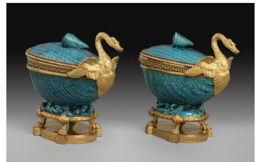
Two pot-pourri vases, gilt bronze by Pierre Gouthière, ca. 1770–75, Chinese porcelain, 18 th century, Musée du Louvre, Paris

In the 1770s and 1780s, the elite of Paris were eager for Gouthière’s work. Jean-Baptiste-Charles-François, Marquis of Clermont d’Amboise, may have commissioned the pair of pot-pourri vases from Gouthière in the early 1770s before he left for the court of Naples, where he served as ambassador from 1775 to 1784. Achieved by employing a range of treatments of the bronze, the naturalism of the swans is particularly impressive. Their flashing eyes express fury: as if about to attack, they raise their wings on either side of the porcelain pots. Their aggressive posture (seen in the detail on the front of this release) is also indicated by their slightly open beaks, which are edged with burnished gold. The shape of their beaks identifies these birds as mute swans, a species common in Europe.