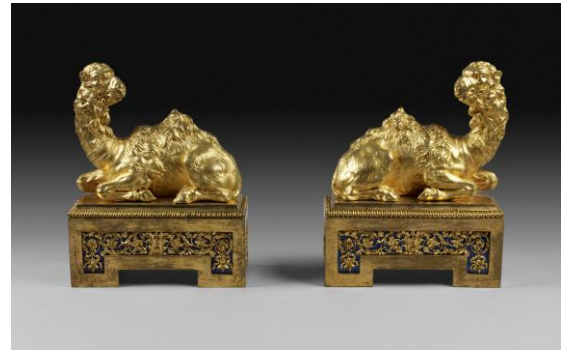
Pair of firedogs, Pierre Gouthière, 1777, gilt bronze and blued steel, Musée du Louvre, Paris

Barry is notorious, dividing the court of France between the pro-Marie Antoinette camp and those who preferred flattering Madame Du Barry. Gouthière managed to work for both. In 1777, he was asked to create several items for Marie Antoinette’s small Cabinet Turc at the Château de Fontainebleau. This prestigious commission included a pair of firedogs, a chimneypiece, a chandelier, a pair of wall lights, and a shovel and tongs with handles in the shape of “African heads.” Only the firedogs and chimneypiece (still in situ at the Château de Fontainebleau) have survived. A firedog is the decorative façade of an andiron, a metal support that holds burning wood in a fireplace. The design of these examples, in the shape of seated dromedaries, was in keeping with the oriental decorative theme of the Cabinet Turc, which was meant to transport the queen into a world of fantasy, sensuality, and refinement. The bases are adorned with an elegant arabesque frieze characteristic of the neoclassical style favored by the queen.