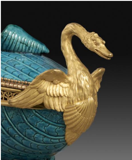
Pot-pourri vase (detail), gilt bronze by Pierre Gouthière, ca. 1770–75, Chinese porcelain, 18 th century. Musée du Louvre, Paris

November 16, 2016, through February 19, 2017