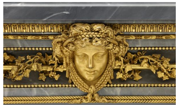
Side table (detail), marble supplied and carved by Jacques Adan, gilt bronze mounts by Pierre Gouthière after a design by François-Joseph Bélanger and Jean-François-Thérèse Chalgrin, 1781, bleu turquin marble and gilt bronze, The Frick Collection, New York; photo: Michael Bodycomb

Gouthière's 1781 invoice refers only to a "head." It is placed between two thyrsi (a staff topped with a pinecone and entwined with ivy, usually carried by Bacchus) and surrounded by ivy leaves (a living allegory of the Roman god's eternal youth), thus Bacchus springs to mind; the braids and pearls suggest a female. Either way, he or she is deep in thought. The hair—a tour de force in itself—is wavy, arranged into curls or