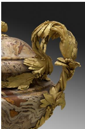
Vase (detail), gilt bronze by Pierre Gouthière after a design by François-Joseph Bélanger, ca. 1770–75, alabaster (probably 18 th -century), green marble, and gilt bronze, private collection

In addition to the king and his mistress, Gouthière’s clientele comprised other wealthy members of the royal court. He produced some of his masterpieces for Louis-Marie-Augustin, the Duke of Aumont, who directed the Menus-Plaisirs et Affaires de la Chambre du Roi, an administrative body of the king’s household that managed the monarch’s personal effects and organized his entertainment, creating sets for theatrical productions and significant occasions such as marriages and funerals. The artists employed by the Menus-Plaisirs were free to develop new ideas without constraint, and their workshops were the locus for the forging of new fashions. The Duke of Aumont employed several artists from the Menus-Plaisirs (including Gouthière) to create objects for his personal cabinet of curiosities, housed in his sumptuous residence on Place Louis XV in Paris, now the Hôtel Crillon, Place de la Concorde. The cabinet was renowned among connoisseurs for its exquisite antique marbles, mounted porphyry, Asian porcelain, and gilt-bronze objects.