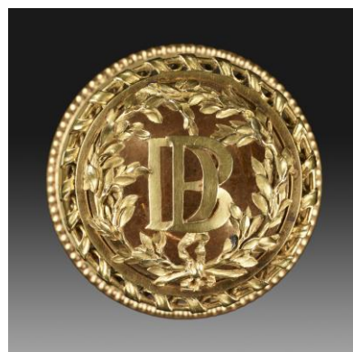
Knob for a French window, Pierre Gouthière, after a design by Claude-Nicolas Ledoux, ca. 1770, gilt bronze, Musée des Arts décoratifs, Paris

depicting The Progress of Love , painted for the same room and now in The Frick Collection, attest to the pavilion's former glory. Each myrtle leaf, a symbol of the goddess Venus, is rendered in exquisite detail, forming a sort of lacework that contrasts with the smooth surface of the interlinked D and B , the royal mistress's initials. The knob alone confirms the recollections of the painter Élisabeth Vigée Le Brun, who, writing in the 1830s about her time spent in Du Barry's residence decades earlier, recalled that the "salon was ravishing ... the chimneypieces, the doors, everything was fashioned in the finest possible way; even the locks could be admired as masterpieces of the goldsmith's art."