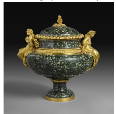
Vase, gilt bronze by Gouthière after a design by François-Joseph Bélanger, ca. 1775–80, green Greek porphyry and gilt bronze. Musée du Louvre, Paris

him. This fall, New York's Frick Collection presents the first exhibition devoted to Gouthière, a project that brings together twenty-one of his finest masterpieces, drawn from public and private collections across Europe and the United States. Many of these remarkable objects—from firedogs, wall lights, and doorknobs to elaborate mounts for rare Chinese porcelain and precious hardstone vases—have never before been shown publicly in New York, and their assembly in an exhibition will provide the basis for a fresh understanding of his oeuvre. With new art historical and technical research by leading experts in the field, the exhibition and accompanying catalogue shed fresh light on the life, production, workshop, and clientele of this incomparable