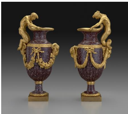
Pair of ewers, gilt bronze by Pierre Gouthière, ca. 1767–70, porphyry and gilt bronze, private collection