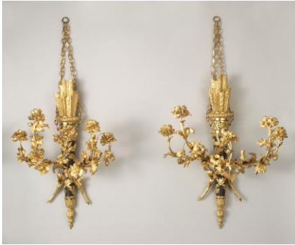
Pair of wall lights, Pierre Gouthière after a design by François-Joseph Bélanger, ca. 1780, gilt and patinated bronze, Musée du Louvre, Paris; photo: RMN-Grand Palais (Musée du Louvre) / Art Resource, NY/ Martine-Beck Coppola

plaited into braids that intermingle with a strand of pearls and branches of ivy. Both the branches and the veins of the ivy leaves are irregular, presenting an appearance so natural they seem to be actual specimens dipped in gold. Adding further refinement to the leaves, Gouthière employed a technique called dégraissage , or “paring back,” in which he reduced the thickness of the metal on edges and sides to render it more delicate. The leaves are matte gilded, while the fruit is burnished to emphasize the contrast between matte and shiny surfaces. The daring design (with some leaves overlapping others) and the lightness achieved through dégraissage are admirable.