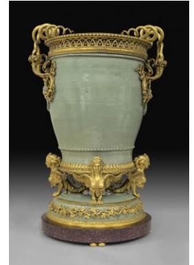
Vase, gilt bronze by Pierre Gouthière after a design by François-Joseph Bélanger, 1782, 18 th -century Chinese celadon porcelain, porphyry, and gilt bronze, Musée du Louvre, Paris

On a pair of Chinese vases (originally used as garden seats), Gouthière created for the Duke of Aumont mounts after a complex design by François-Joseph Bélanger, whose composition of arabesques, snakes, and harpies was considered the height of fashion in the 1780s. Gouthière's gilt-bronze interpretation of the architect's design shows his command of the medium. The snakes' backs are chased to create the illusion of small scales, while their bellies feature larger scales to imitate the skin of a live snake. Although bronze makers usually attached their mounts to porcelain by drilling holes in it, Gouthière again demonstrates his virtuosity by creating mounts that fit securely on the vases without piercing the fragile ceramics.