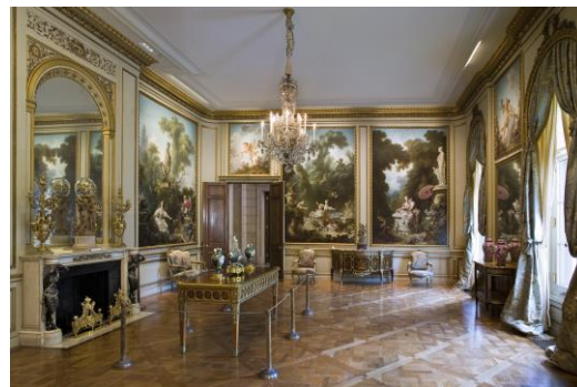
The Fragonard Room, The Frick Collection New York

Gouthière's commissions for Madame Du Barry include the knob for a French window that he made for the countess's pavilion of Louveciennes, one of France's most lavish eighteenth-century buildings, designed by the architect Claude-Nicolas Ledoux. Although it can no longer be appreciated in its original setting (the interior decoration was removed and sold to various collectors after the French Revolution), rare elements like this knob made for the pavilion's Salon en Cul-de-Four, as well as Jean-Honoré Fragonard's four panels