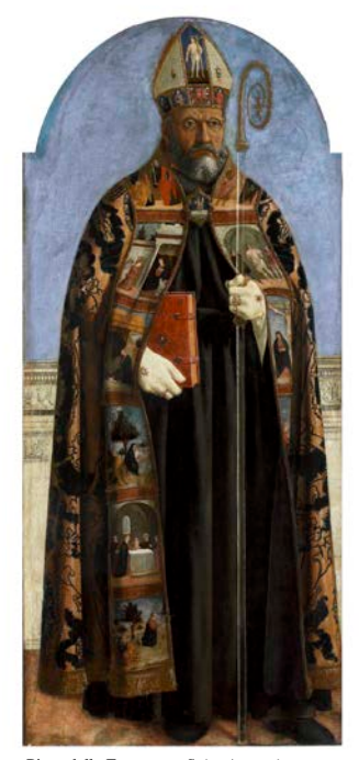
Piero della Francesca, Saint Augustine , 1454–69, oil and tempera on poplar panel, Museu Nacional de Arte Antiga, Lisbon

The altarpiece takes its name from Saint Augustine (Sant'Agostino), a fifthcentury bishop and one of the fathers of the church. In his painting, at right, Piero characterized Augustine as a man in later middle age with a bushy salt-andpepper beard. His brow furrowed in concentration, Augustine wears a richly decorated cope (a semi-circular brocaded cloak) over a long black habit. Elevated to the status of bishop during his lifetime, Augustine is shown wearing a pointed miter, his ceremonial emblem of office. Its gem-encrusted surfaces exemplify the wealth of material detail that embellishes this figure, including a translucent rock crystal staff, precious jewels, and lavishly embroidered robes. Piero conveyed the grandeur of Saint John the Evangelist more subtley. Barefoot and sunburnt, the saint gazes down with his attention focused, reading silently from a book. The gravitas of John's appearance is emphasized by his magnificent drapery. His arms are wrapped in a rich vermillion cloak, the deep folds of which suggest the weight of the costly fabric. Beneath it he wears a blue-green robe, its hem is adorned with gilt embroidery punctuated by rubies and aquamarines set off by a delicate border of pearls.