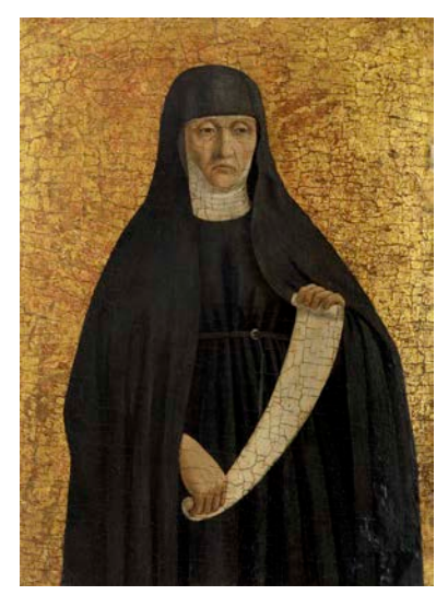
Piero della Francesca, An Augustinian Nun (Saint Monica), 1454–69, oil and tempera on poplar panel, The Frick Collection

only eight are known to survive: the Frick's Saint John the Evangelist, An Augustinian